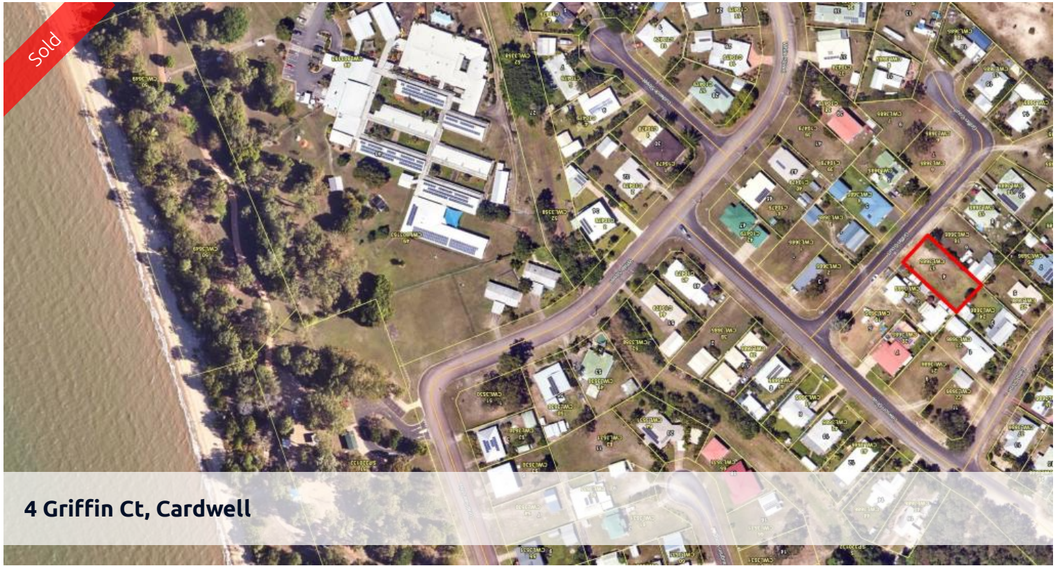
4 Griffin Ct, Cardwell