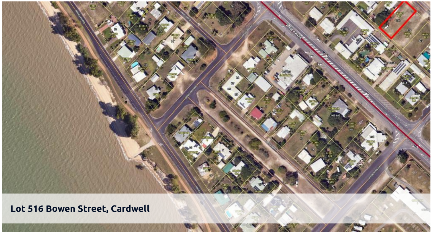
Lot 516 Bowen Street, Cardwell