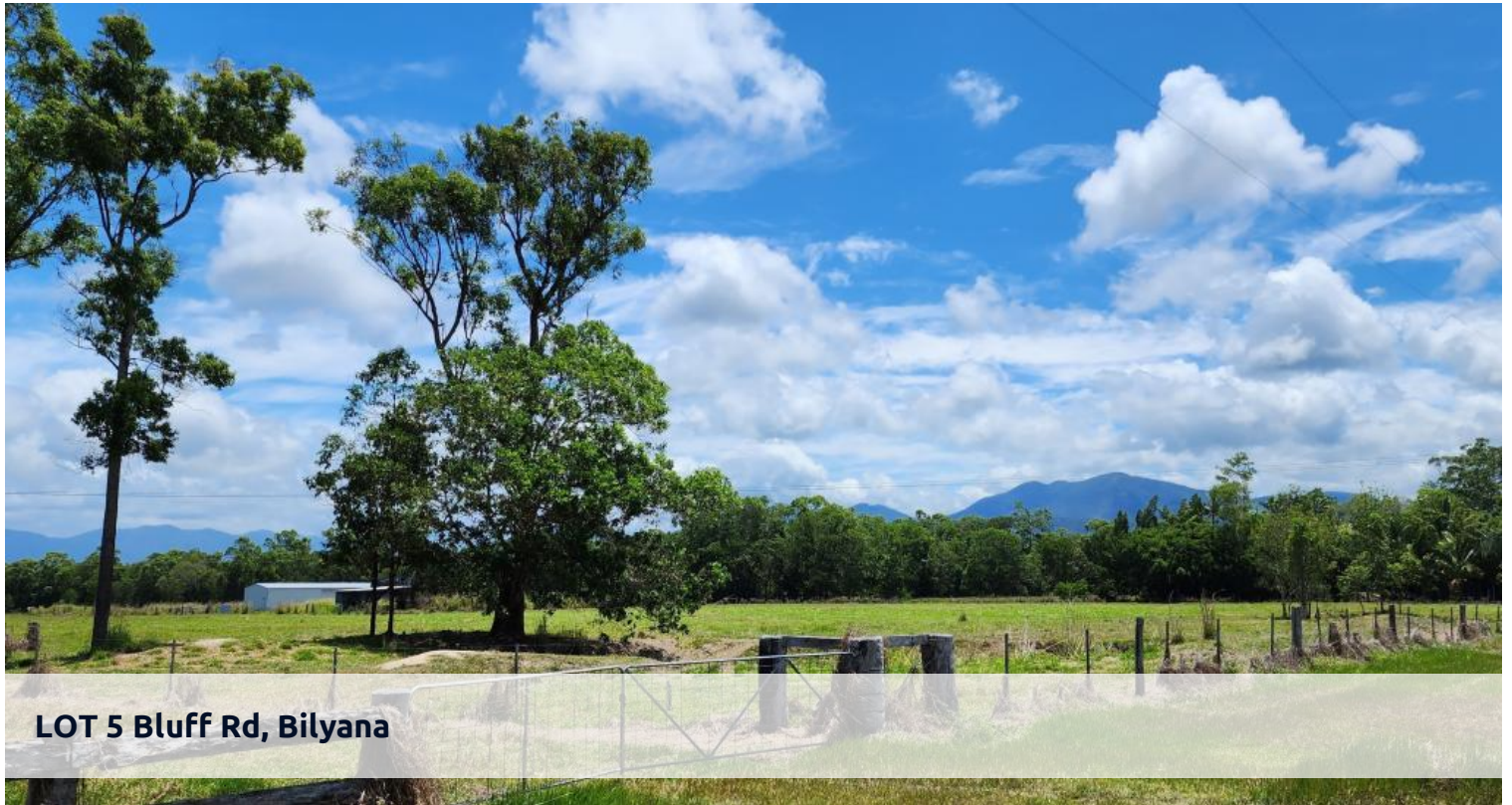
LOT 5 Bluff Rd, Bilyana