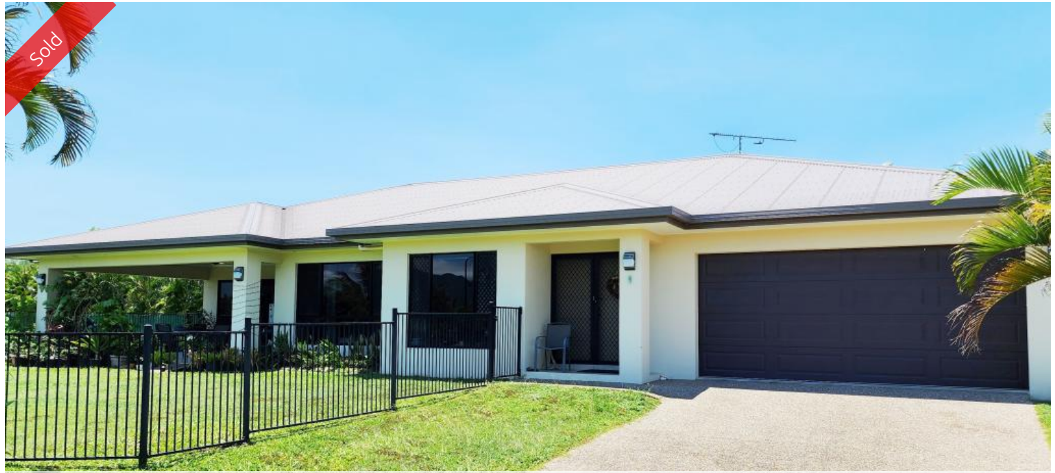
9 Golden Cane Crescent, Cardwell