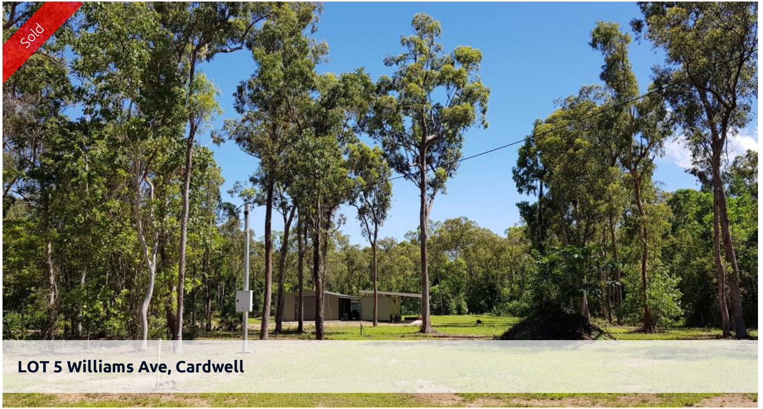
LOT 5 Williams Ave, Cardwell