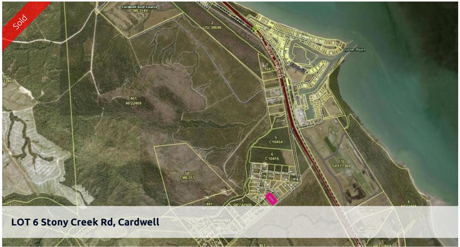
LOT 6 Stony Creek Rd, Cardwell