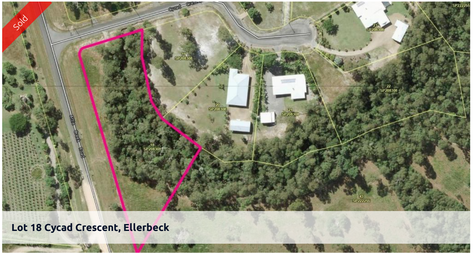
Lot 18 Cycad Crescent, Ellerbeck