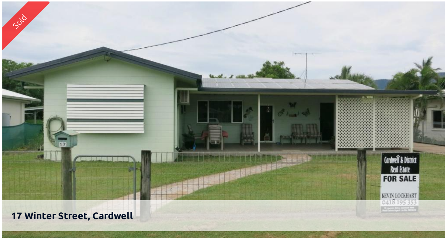
17 Winter Street, Cardwell