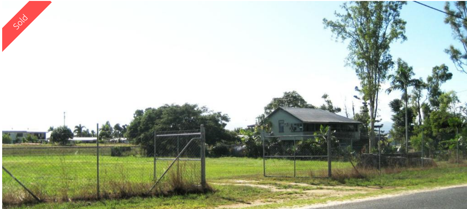
126 Roma Street, Cardwell