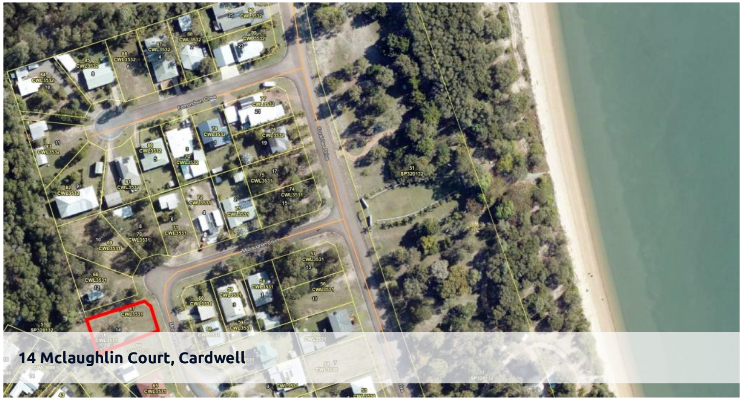
14 McLaughlin Court, Cardwell